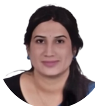
ANITA Life Sciences

The Twelve Nominated Members in Rajya Sabha: An Analysis of Their Representation